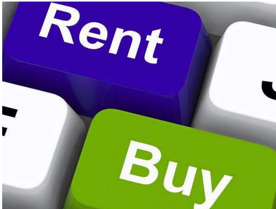
BIG DECISIONS: It may be coming to crunch time for those looking to buy in the region alexacel

REIQ data shows Gladstone's residential vacancy rate has fallen for the September quarter to 5.7 per cent. It dropped from 6.5 per cent in June, and has been falling since June last year.